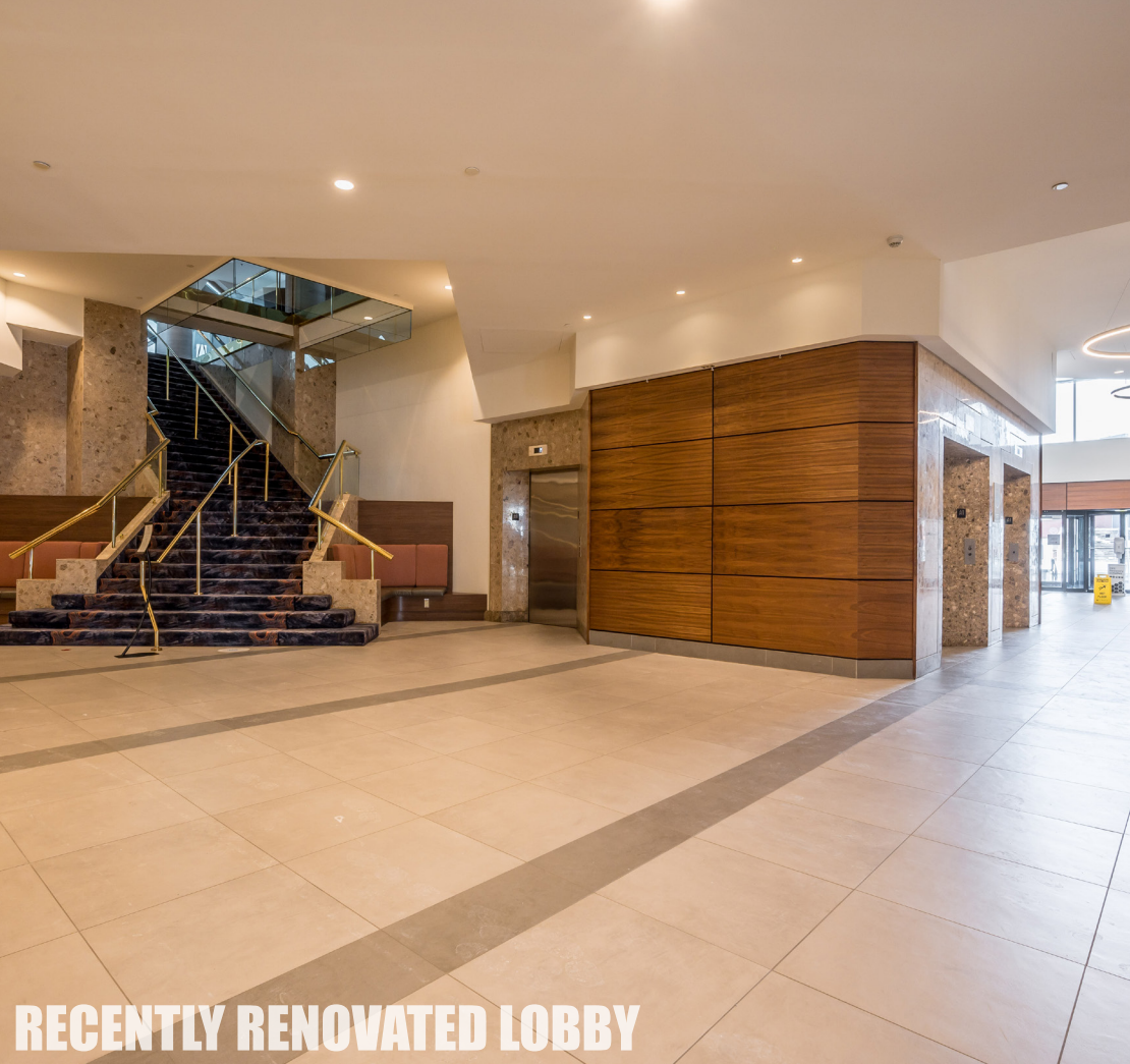
RECENTLY RENOVATED LOBBY