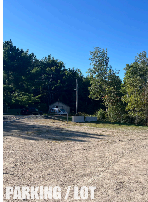
PARKING / LOT