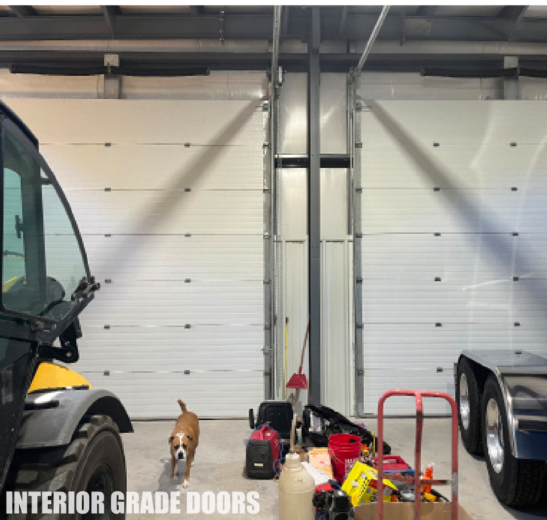
INTERIOR GRADE DOORS