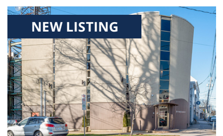
2570 & 2578 Agricola Street, Halifax

Building: 5,400 sq. ft. / Lot: 5,128 sq. ft. $2,950,000