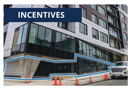
5426 Portland Place, Halifax