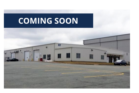
667 Barnes Road, Enfield