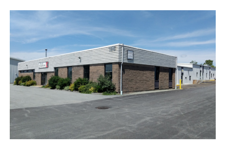
196 Joseph Zatzman Drive, Dartmouth