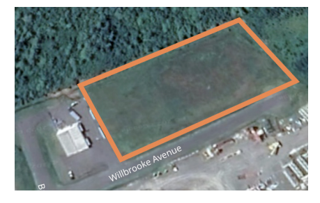
Willbrooke Avenue Land, Westville