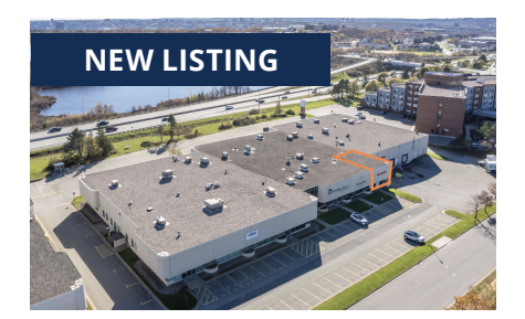
250 Brownlow Avenue, Unit 20, Dartmouth