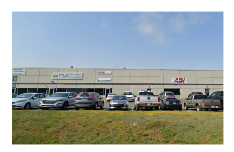
90 Raddall Avenue, Unit 4, Dartmouth