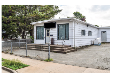
3208 Isleville Street, Halifax