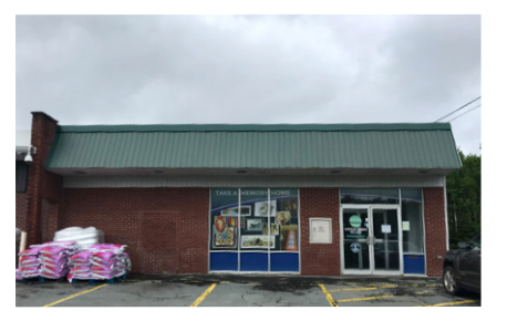
8990 Highway 7, Head of Jeddore