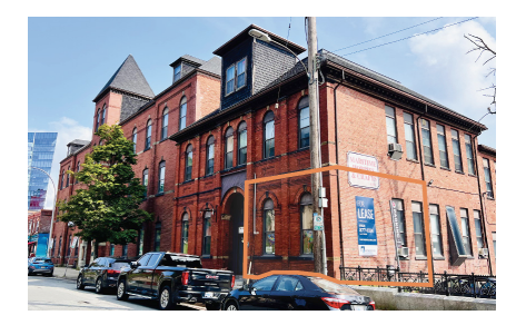
1521 Grafton Street, Retail Space, Halifax