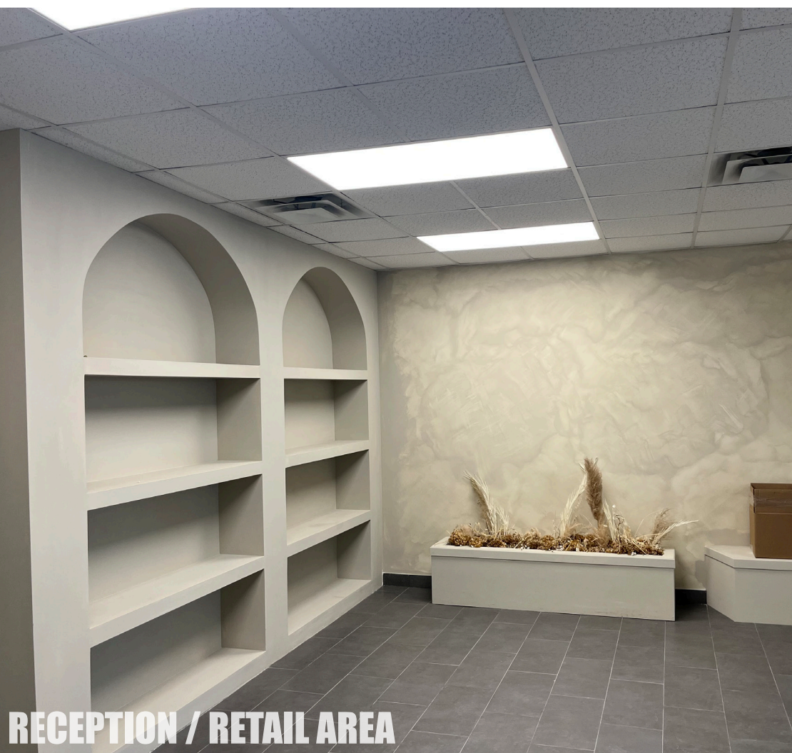
RECEPTION / RETAIL AREA