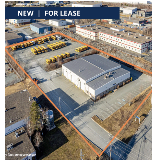
51 FRAZEE AVENUE, DARTMOUTH