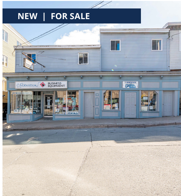
5514 CUNARD STREET, HALIFAX