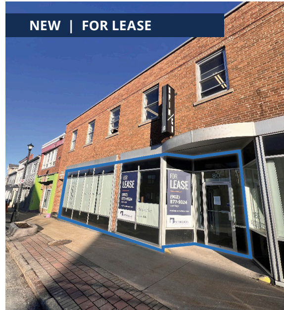
80 PORTLAND STREET, DARTMOUTH