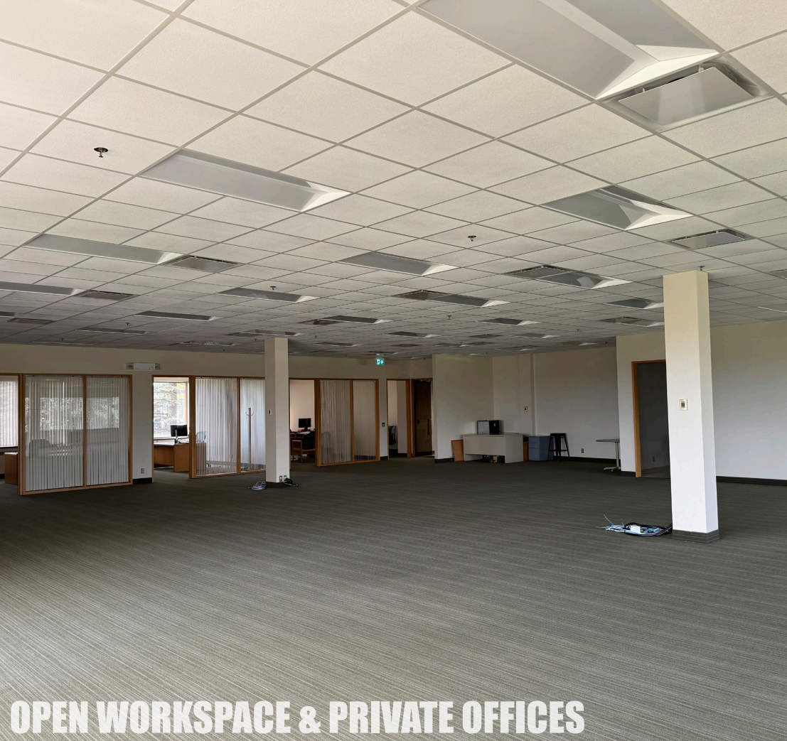
OPEN WORKSPACE & PRIVATE OFFICES